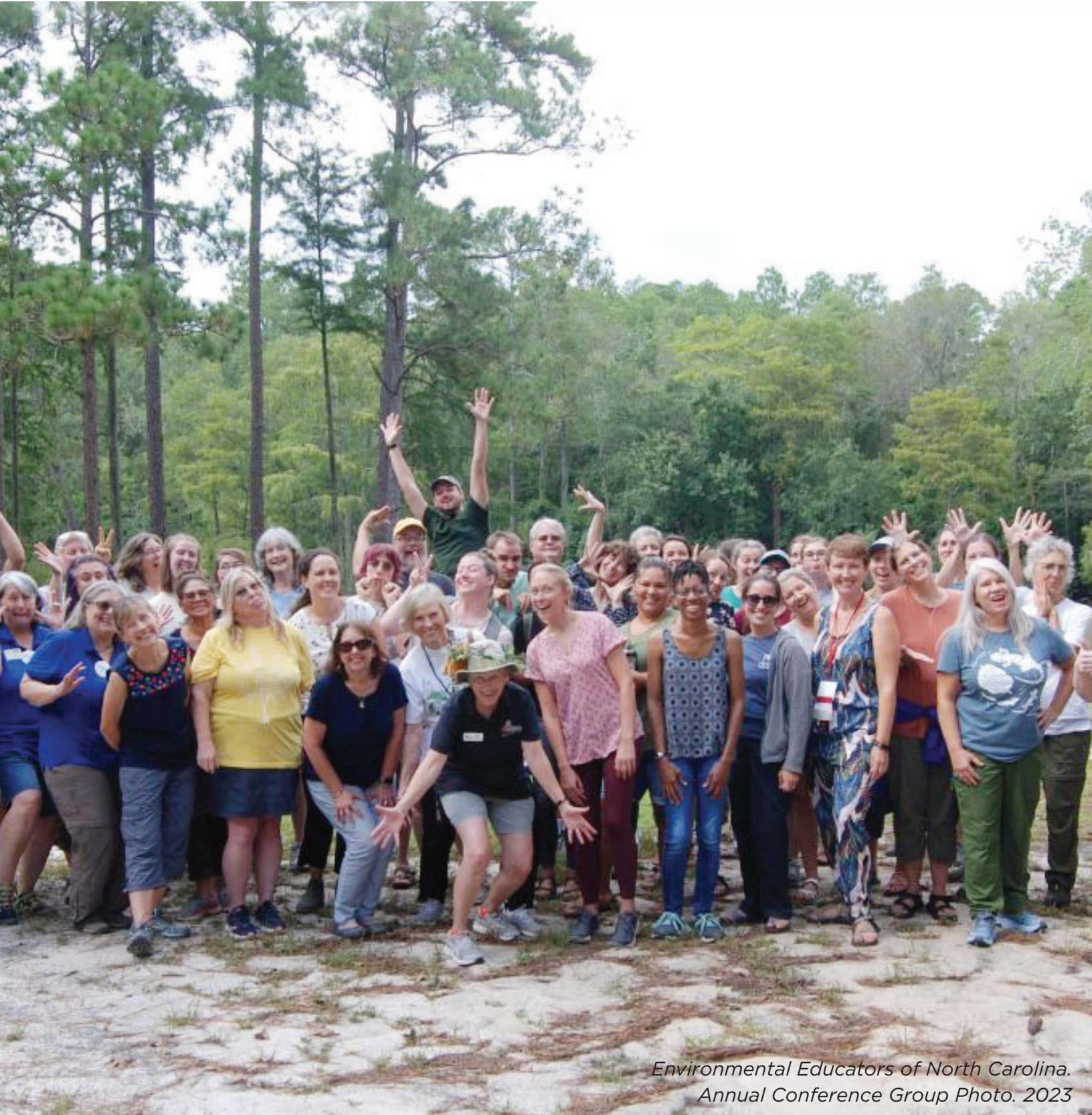
Environmental Educators of North Carolina. Annual Conference Group Photo, 2023